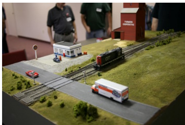
Two views of a module that Bill brought in for participants to examine.