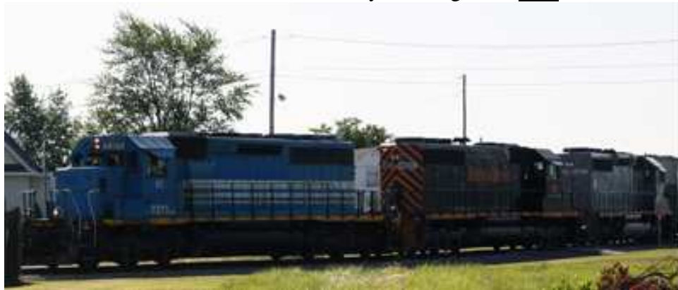
W&LE SD40-3's in three different paint schemes, Bellevue, Ohio, Jun. 6, 2012

Bellevue, OH: It's been a great summer for chasing the prototype. Here's a Wheeling & Lake Erie freight west bound into the heart of Bellevue on a hazy morning. Did you chase trains this summer?