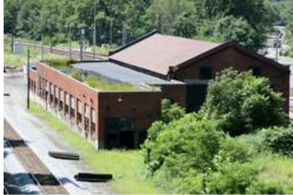
Former B&O engine facilities at MK Junction near Rowlesburg, W. Va. August 10, 2013.

Have you been trackside lately? There's plenty to watch, photograph, or research.